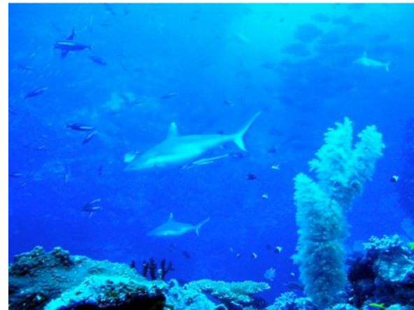
Plate 2. Grey reef sharks, snappers and reef fishes at a deep fringing reef location.

In addition, it had been observed in 2001 that the northern and eastern slopes of Vamizi had not been affected by the 1998 bleaching event, contrasting with the findings of Motta et al. (2002) in the southern Querimbas. The resilience of coral communities on these slopes is likely to be associated with the proximity of the reef to cool deep waters and the fast water flow created by currents, both being recognised