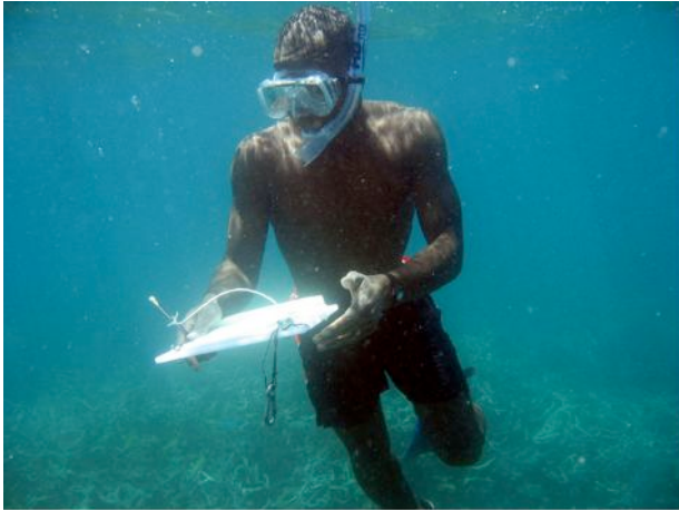
Plate 4. Local monitor being trained to assess reef fish populations.

around Vamizi. In partnership with government and IDPPE ( Instituto das Pescas de Pequena Escala or Small-Scale Fisheries Institute), Maluane has supported the creation and capacity building of the CCPs, which is still on-going.