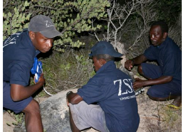
Plate 5. Turtle monitors tagging and measuring a green turtle.

In addition, a community-based turtle monitoring programme has been developed on Vamizi and Rongui islands since 2002, also raising awareness of local communities on marine conservation issues. This