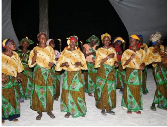
Plate 6. Cultural group of the women's Association performing traditional dances at Vamizi lodge.

access adequate fishing gear and being restricted by trade opportunities (Guissamulo et al. , 2003). In addition, the increased pressure on marine resources associated with the presence of itinerant fishers often forced resident fishers to become partners with itinerant fishers, thus obliging them to use destructive fishing techniques, such as small-mesh seine nets, mosquito nets and spear guns. A majority of these fishers is just too poor to afford alternative gear and this is their only means of providing food for their families.