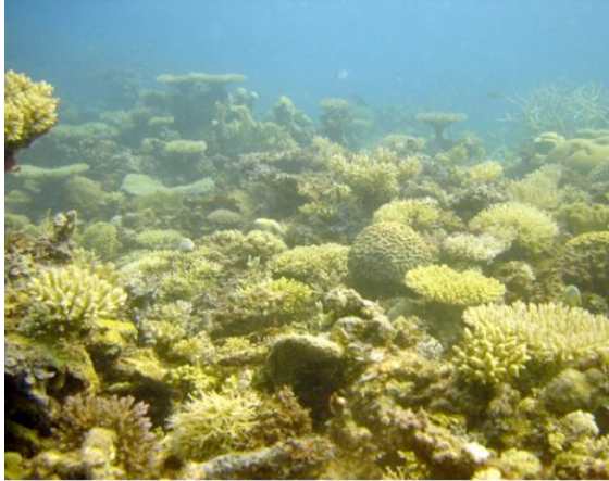
Plate 1. Diversity of coral species at Vamizi reef and extensive habitats.

excluding cryptic and small species. Both surveys were undertaken in collaboration with the Natural History Museum of Maputo and the University E. Mondlane at Maputo, with whom Maluane has developed strong links and which always send Mozambican students for training in conservation management techniques with Maluane. Coral reefs around Vamizi were identified as being very healthy and productive (Plate 1). The average coral cover was 37% (range 22-63%), with low levels of injury (<15%) and death (<10%) of corals. REA of 36 sites within 12 locations identified the presence of 183 coral species in 46 genera from 14 families (Table 1). Each location surveyed has a broad suite of coral species with over 75% locations having over 45% of the total species observed. Locations on the northern slopes of the island scored a higher species richness than other sites, reflecting their semi-sheltered environment