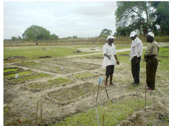
Plate 7. Vegetable farm providing farmers with an alternative livelihood.

Although still in the very early stages, some of these small businesses have started to generate revenues and have created alternative livelihood