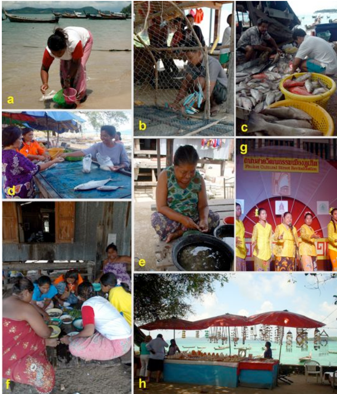
Photo captions: a) Collecting polychaetes for fish bait, Sireh village (© Tamelander); b) Making fish trap, Rawai village. Traps made are getting larger and larger (© Tamelander); c) Sorting fish catch, Rawai village (© Tamelander); d) Seafood vendor, Rawai village (© Narumon); e) Extracting rock oyster meat, Sireh village (© Narumon); f) Extended family having a meal, Rawai village. Home-cooked food made from local marine catch and vegetables grown in household garden patches is important for the Urak Lawoi (© Tamelander); g) Traditional singing and dancing troupe from Sireh (© Narumon); h) Selling seashells, Rawai Beach (© Narumon).